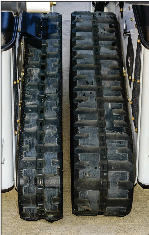
Machine: MT100 Standard and optional wide track

Multi-bar lug tracks (standard on MT120) combine increased traction with low vibration and excellent operator comfort. These flexible, cut-resistant and anti-gouge tracks are structurally designed to match the needs of your Bobcat mini track loader. Two different track sizes provide your preferred combination of performance and ground pressure.