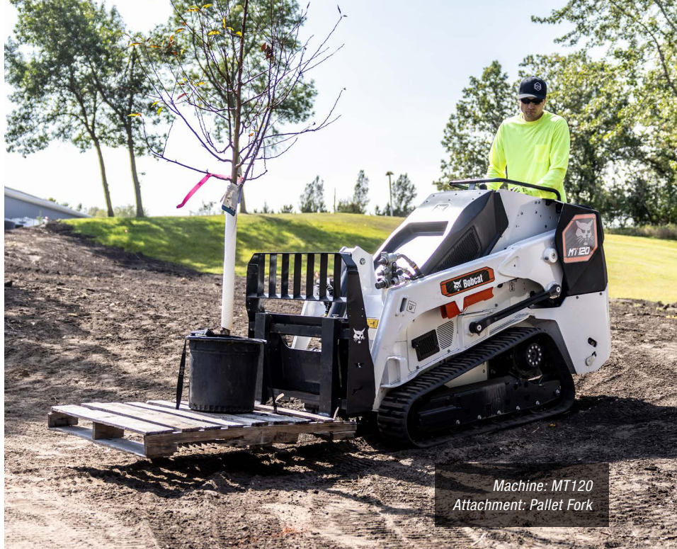
Machine: MT120 Attachment: Pallet Fork

Rollers and idlers are permanently sealed and lubricated to reduce undercarriage maintenance and leave more time for your jobsite tasks. The MT120 also features maintenance-free bushings in the work group, as well as a direct system with no belts for less maintenance.