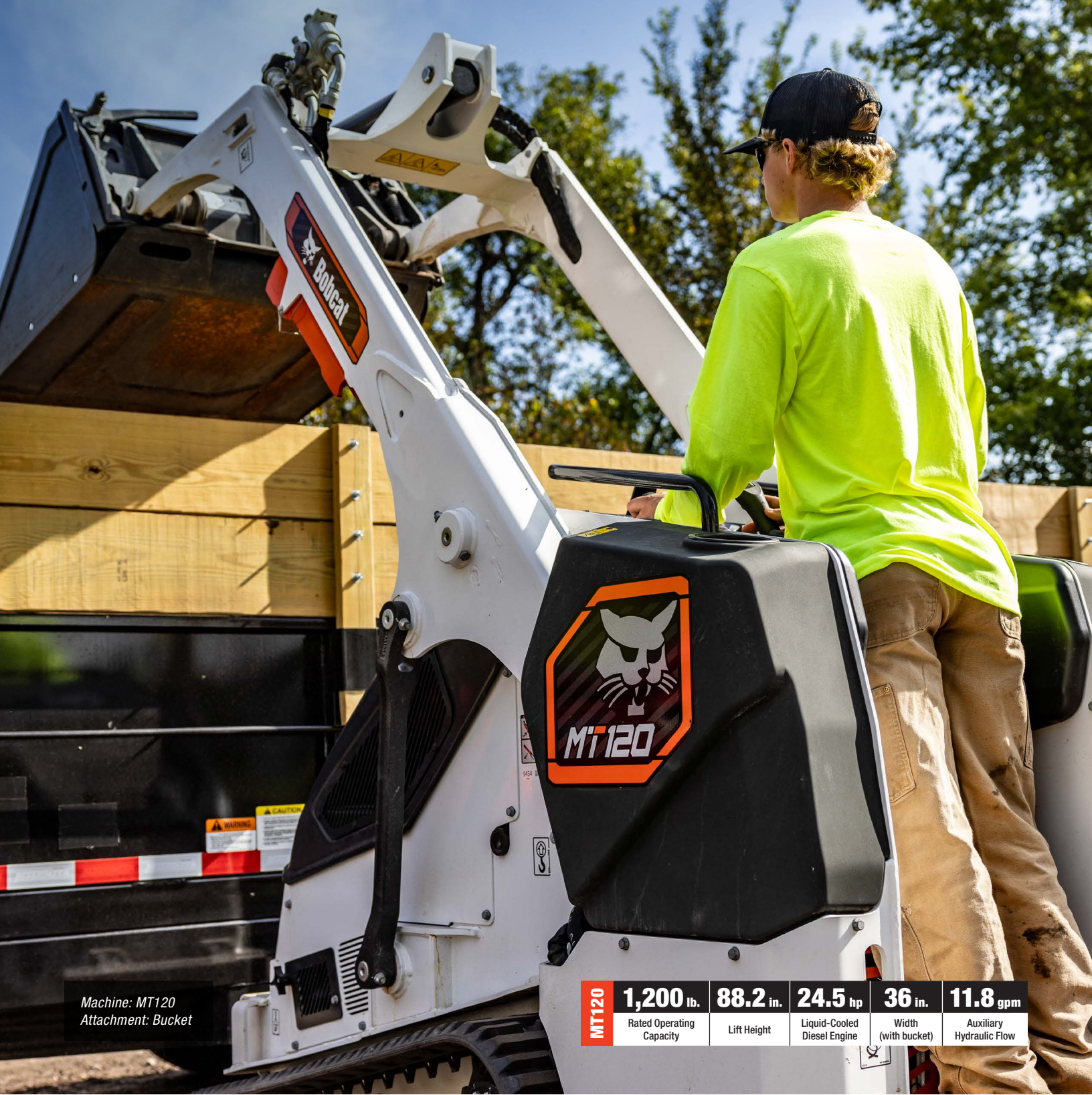
Machine: MT120 Attachment: Bucket