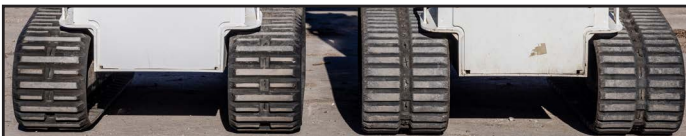
Machine: MT120 Standard and optional wide track