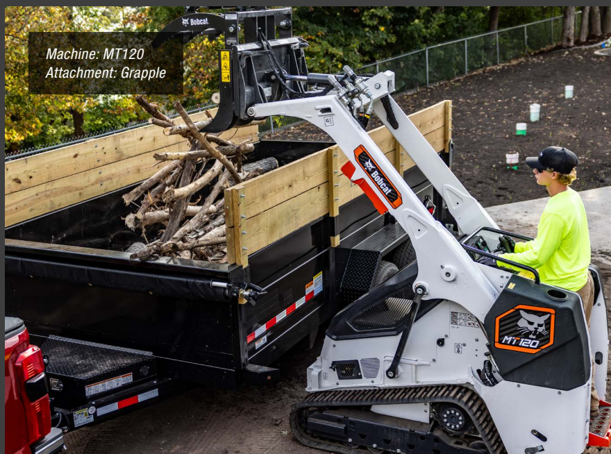
Machine: MT120 Attachment: Grapple