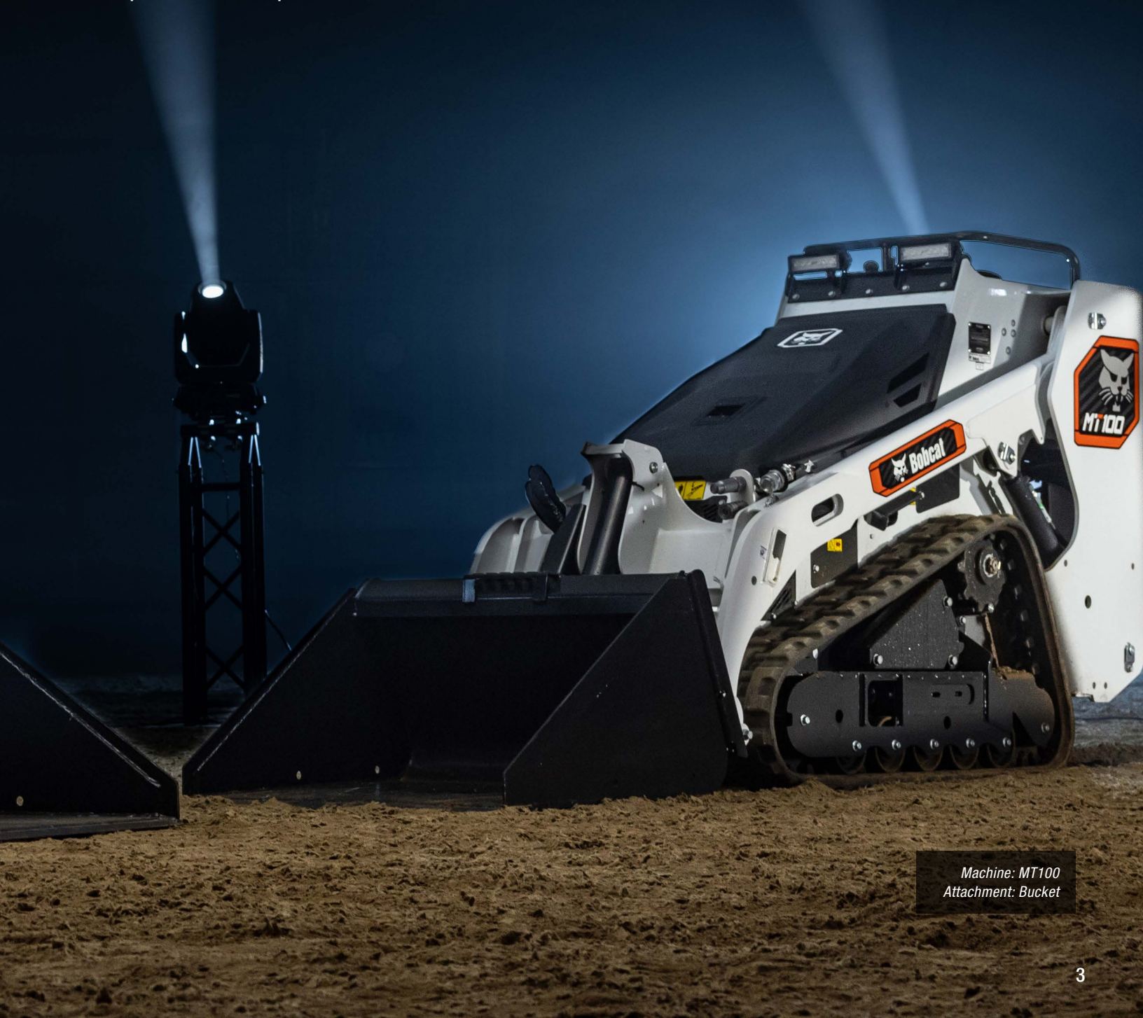
Machine: MT100 Attachment: Bucket

For landscapers, contractors and rental stores, a Bobcat mini track loader makes a productive and profitable investment.