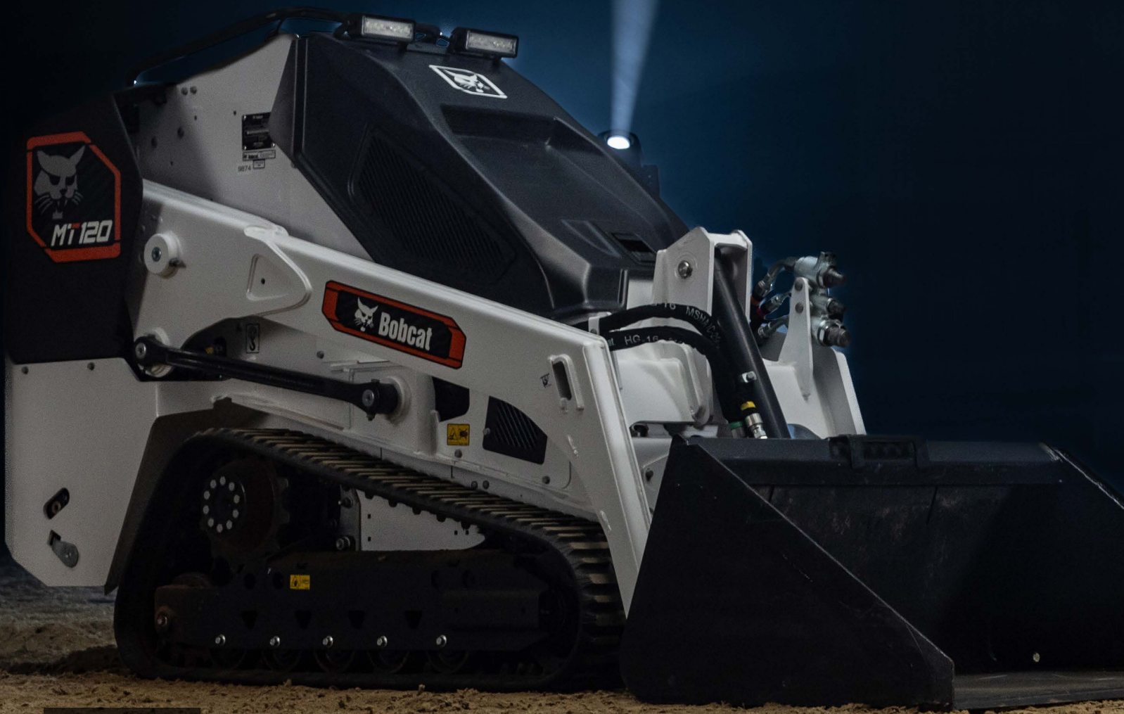
Machine: MT120 Attachment: Bucket